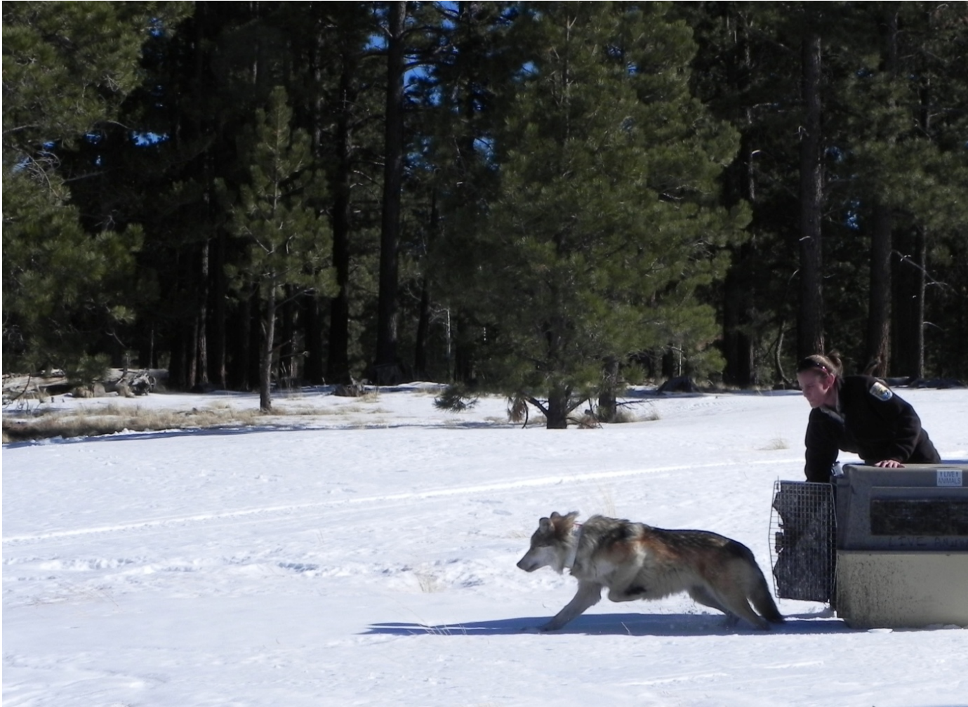
Translocation of Mexican wolf M1049 to the wild in January 2011