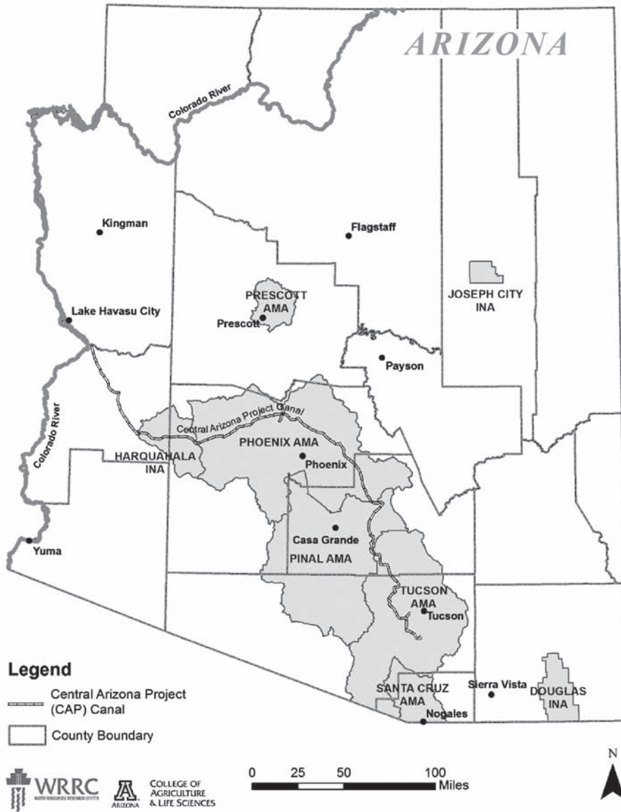
Figure 1: Arizona Active Management Areas and Irrigation Non-Expansion Areas

Since 1980, the focus of the safe-yield AMAs has been achieving/maintaining safe-yield by the statutory deadline of 2025. ARS 45-462 states: “The management goal of the Tucson, Phoenix and Prescott active management areas is safe-yield by January 1, 2025, or such earlier date as may be determined by the director.” Although the GMA Act specifies this deadline for achieving the management goal, recall that the definition of the safe-yield goal includes the word “attempts.” It would appear that a documented “attempt” to achieve and thereafter maintain a balance between inputs and outputs of groundwater could signal meeting the goal. Moreover, there are no penalties established in the GMA for non-compliance.